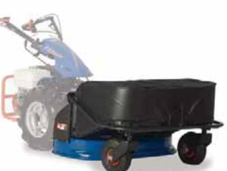
38" LAWN MOWER