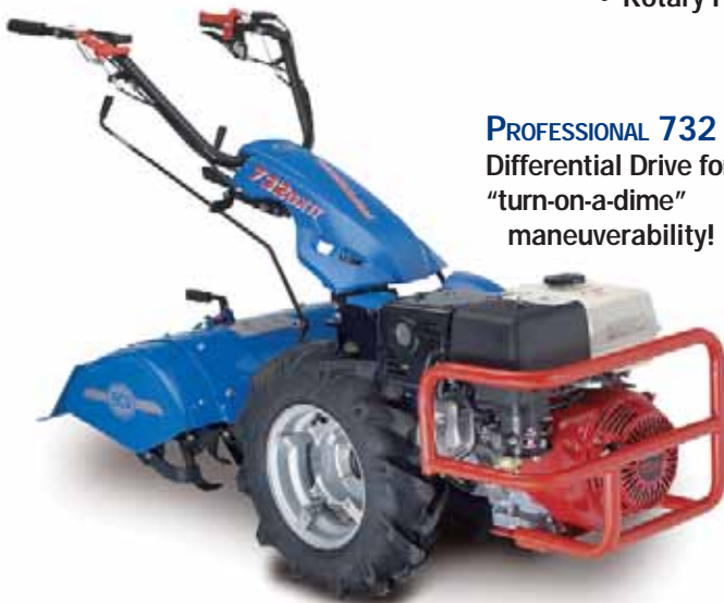
PROFESSIONAL 732 Differential Drive for "turn-on-a-dime" maneuverability!

* May require removal of engine frame weights.