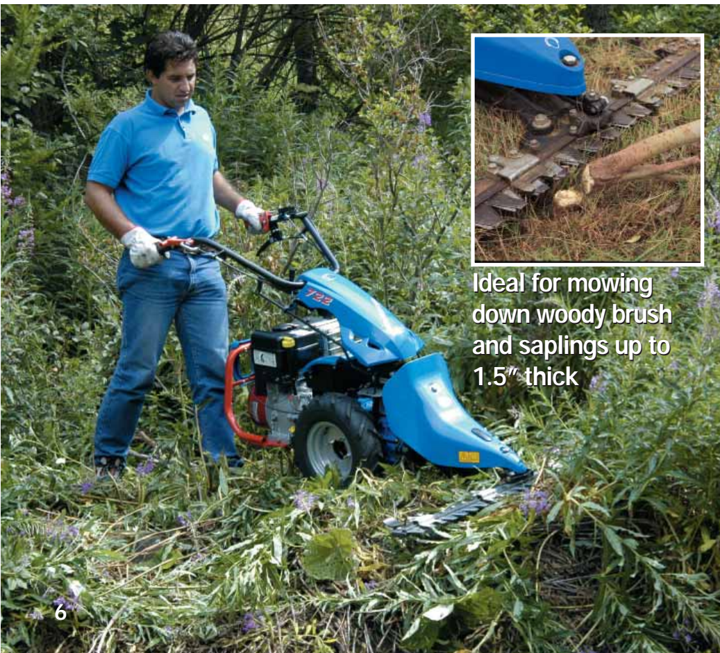
Ideal for mowing down woody brush and saplings up to 1.5" thick

Mow bravely into thick, tangled brush and turn your overgrown areas into a second-tier lawn with the amazing BCS Brush Mower. Its unique design features swinging blades much like those of large rotary brush mowers for 4-wheel farm tractors. This gives you both cutting power and protection for your blades and drive mechanism because they swing back away when you encounter a rock or other hard object. The deck floats from side to side to minimize scalping and gives you a more level cut, even on steep slopes. Available in a 26" width, you can easily maneuver in tight spaces where large tractors could never go. Built BCS-tough, its all-steel housing and 1/4"-thick blades can take tremendous punishment while cutting tall weeds and grass, woody brush and saplings up to 1/2" thick.