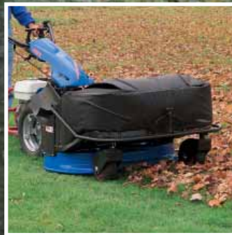
Extend versatility to your manicured lawn in 22" and 38" widths!