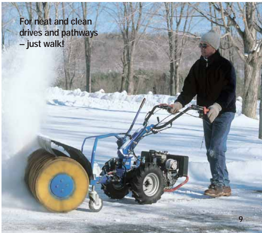
For neat and clean drives and pathways – just walk!