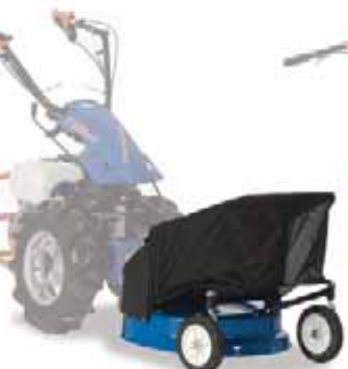
22" LAWN MOWER