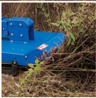
Mow down tall weeds, brush, even saplings!