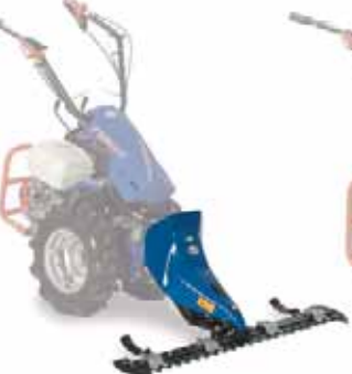
SICKLE BAR MOWER