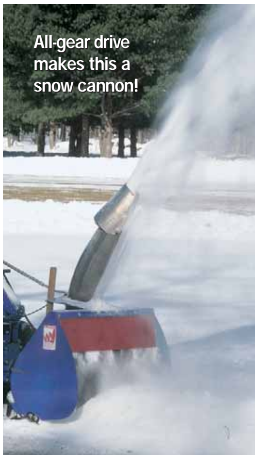
All-gear drive makes this a snow cannon!