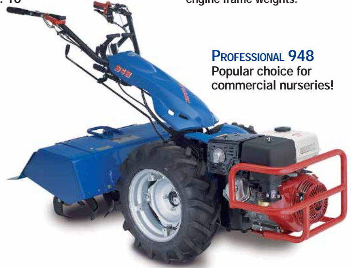
PROFESSIONAL 948 Popular choice for commercial nurseries!